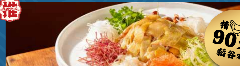
爆款七彩捞手撕稻谷鸡 Signature Rainbow Hand Shredded Grain-Fed Chicken 半隻 / Half RM 68 一隻 / Whole RM 118