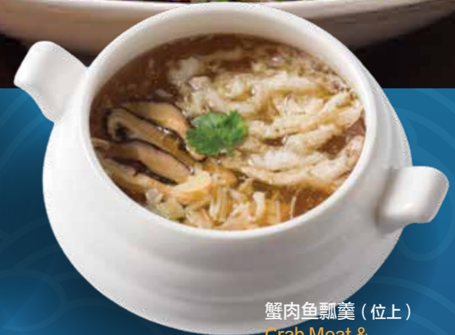
蟹肉鱼瓢羹 (位上) Crab Meat & Fish Maw Soup