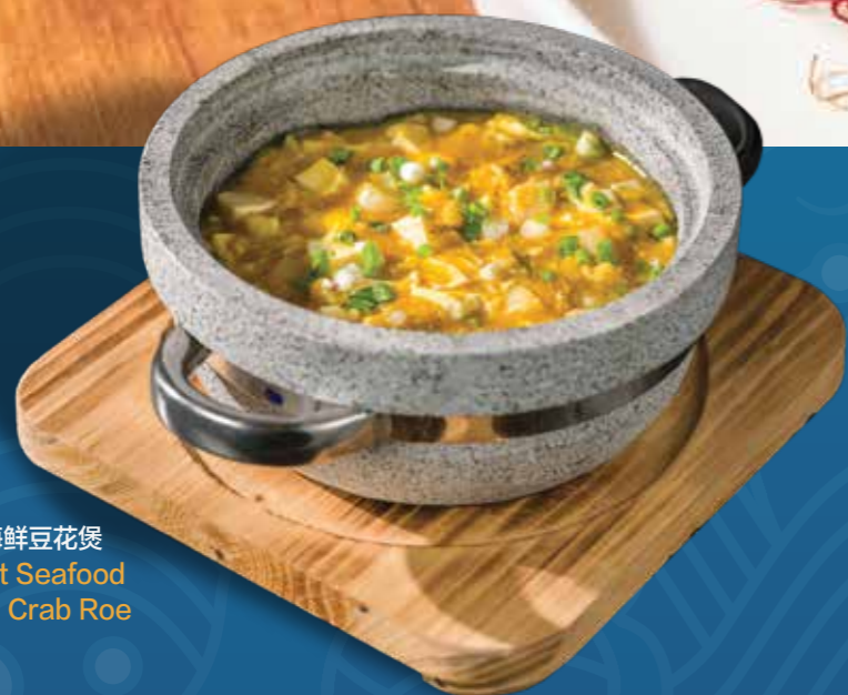
石锅蟹粉海鲜豆花煲 Stone Pot Seafood Tofu with Crab Roe

*All price are exclusive of 6% SST and 10% service charge, for dine in and take away.