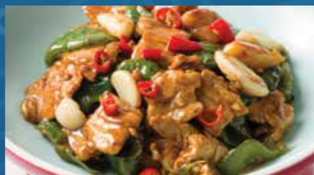
农家小炒肉 RM 35 Spicy Wok-Fried Pork with Green Chili